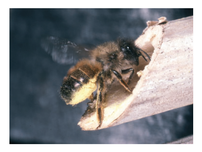
Fig. 1. Osmia bicornis female enters her nest with a full pollen load.

The two bee species O. bicornis (Linnaeus 1758) and O. cornuta (Latreille 1805) are very close relatives. Both are members of the subgenus Osmia and within this subgenus belong to the same monophyletic group ('bicornis group'), which comprises about 15 species worldwide (Peters 1978; Michener 2007). Osmia bicornis and O. cornuta are among the most pronounced pollen generalist solitary bee species in Europe, collecting pollen on at least 18 and 13 plant families, respectively (Westrich 1989). Both species are widespread in the Palaearctic and common in most parts of Central Europe. They nest in a great variety of pre-existing cavities, allowing for artificial breeding in hollow bamboo sticks. The adult females build several brood cells during their lifetime, which lasts for up to 6 weeks (Westrich 1989). Each cell is provisioned with pollen and nectar before a single egg is laid. The hatched larva feeds on the pollen-nectar mixture and develops within a few weeks to the adult insect, which overwinters inside the cell and emerges early in spring.